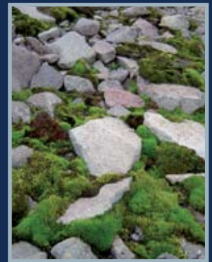
Vegetation is scattered across the site