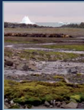
The glacial melt stream is clearly visible in times of limited snow and ice cover