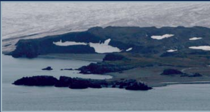
Turret Point from above - towards the primary landing beach

While weather conditions can change rapidly anywhere in the Antarctic, this location is particularly prone to such changes.